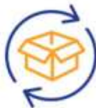
B2B & B2C deliveries and returns management