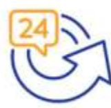
You shop we ship