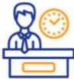
Seamless data flow / API integrations