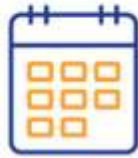
Cross border management with e-commerce